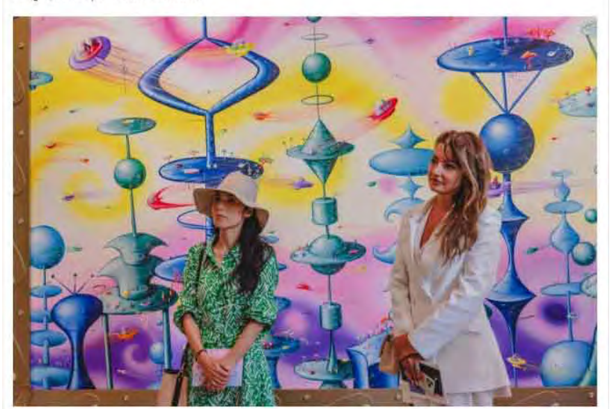
Opera Gallery viewing