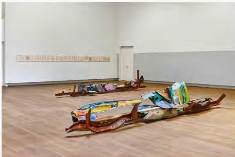
Installation view, John Chamberlain, 'The Poetics of Scale' at Hauser & Wirth Monaco until 2 September 2023. © 2023 Fairweather & Fairweather LTD / Artists Rights Society (ARS), New York. Courtesy the John Chamberlain Estate and Hauser & Wirth. Photo: Jean-Christophe Leff

This exhibition pairs John Chamberlain's early poetry with his sculptural series Gondolas and Tonks from the 1980s , epitomizing the artist's poetic approach to materials and scale . Chamberlain's poetry will be shown publicly for the first time, illuminating a sensitive and little-known aspect of his practice produced at Black Mountain College in the 1950s.