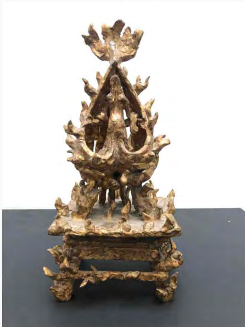
Jacques Lipchitz (1891 – 1973) "La vierge en flammie", 1952 Provenance : The Hirshhorn Museum, Washington

M.-F. Toninelli Art Moderne Monaco offers an inimitable collection of rare sculptures by Jean Arp, Constantin Brancusi, Giorgio De Chirico, Jean Ipousteguy, Asger Jorn, Jacques Lipchitz, Giacomo Manzú, Marino Marini.