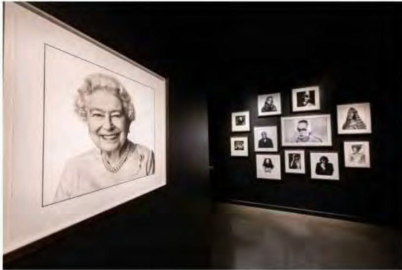
Installation View, 'David Bailey - FACES' at G & M Design Gallery.

G&M Design Gallery presents portraits by the world-renowned photographer David Bailey . The selection not only includes his most iconic celebrity portrait photographs, but also offers a unique insight into his paintings.