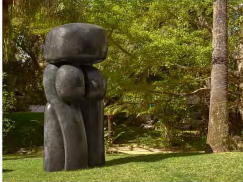
Artcurial Monaco Sculptures WANG Keping (Nai er) 1949