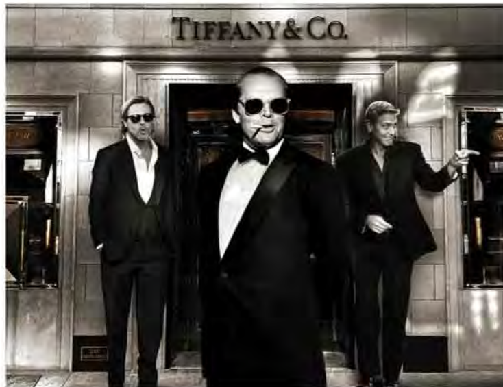
Axel Criegel, Best Men Photography © Teos Gallery Monte-Carlo

Teos Gallery presents a solo exhibition by the German artist-photographer Axel Criegel , whose photo montages are inspired by celebrities and the luxury goods industry.