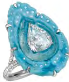
BOGHOSSIAN: Diamond mixed into Paraíba and Turquoise Ring

Boghossian presents its latest collection of jewelry pieces evoking the tranquil waters and clear skies of a blue summer . The collection features an array of stunning stones, which have been handpicked for their unique color, texture, quality and meticulously set using innovative techniques that are the hallmark of the Maison Boghossian.