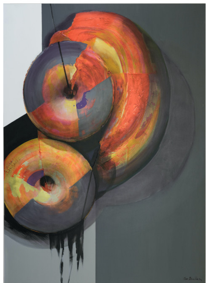
KAMIL ART GALLERY – OLGA SINCLAIR "ESFERAS ESTELARES"

When highlighting remarkable aspects of Monaco Art Week 5th Edition, it's undeniable the match between the traditional art forms and the digital innovations. This union of the classic and the contemporary offers an original and unique immersive experience for the visitors, which also challenges their perspectives and consequently pushes the boundaries of artistic expression. From interactive digital art to modern and captivating virtual reality installations, the fair presents a true showcase of art and technology conversion, while also rising to a new level of emerging creativeness.