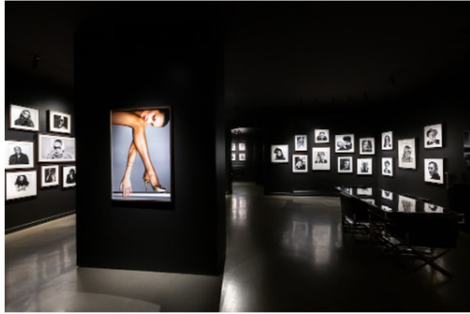
S & M DESIGN GALLERY - DAVID BAILEY VIEW

Monaco Art Week 5th Edition, under the High Patronage of H.S.H. Prince Albert II of Monaco, will take place from 4 to 9 of July this year, with a grand opening ceremony. Coinciding with other significant cultural events in the Principality, such as the remarkable opening of the summer exhibition "Monet in Full Light" at the recognized Grimaldi Forum and the mesmerizing "F(é)aites de la danse" organized by the Ballets de Monte-Carlo, the timing is just perfect. The convergence of art creates an artistic atmosphere, which highlights Monaco internationally as a true cultural heaven.