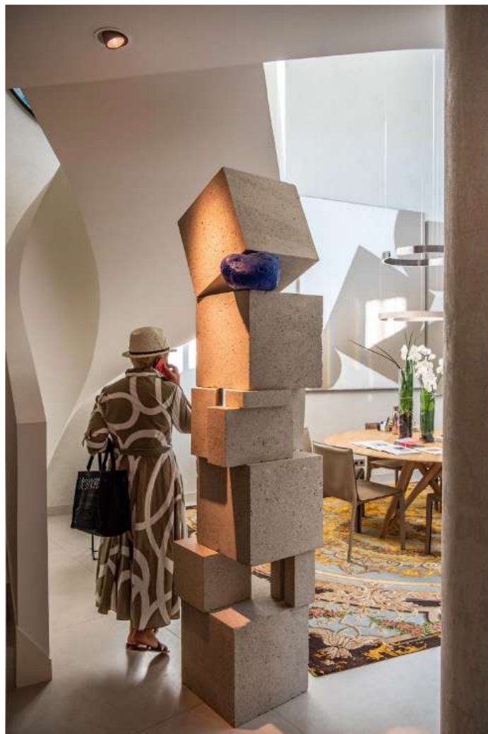
Lenzwerk Monaco.