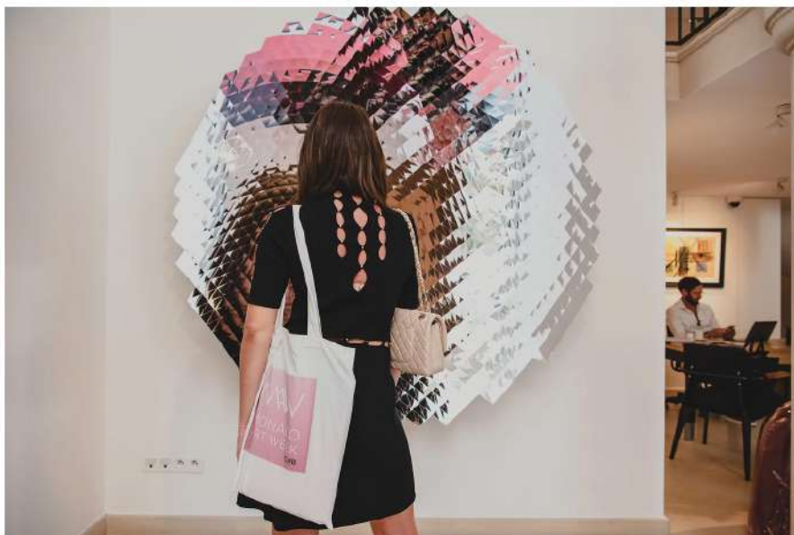
Opera Gallery.

MONACO ART WEEK, placed under the High Patronage of H.S.H. Prince Albert II of Monaco, celebrates this year its 4rd edition, which takes place from July 12 to 17, 2022.