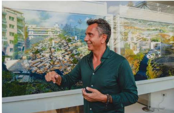
BEL AIR FINE ART, YANN ARTHUS-BERTRAND.