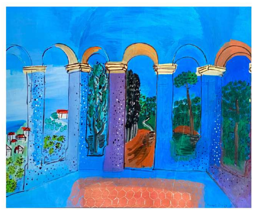
La terrasse a Vallauris, 1927, by Raoul Dufy. Oil on Canvas.