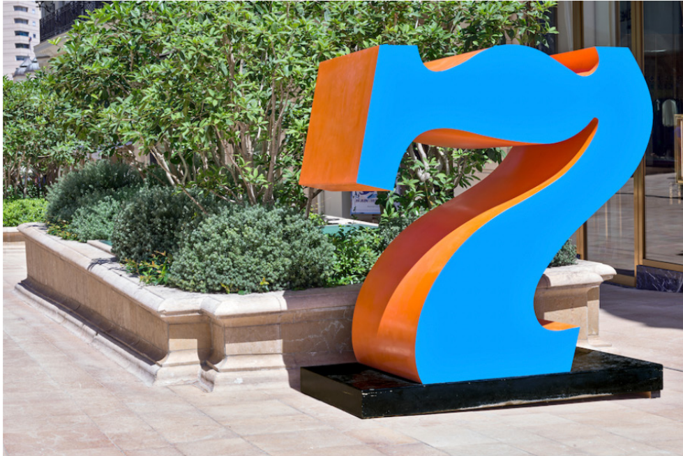
Installation by Robert Indiana