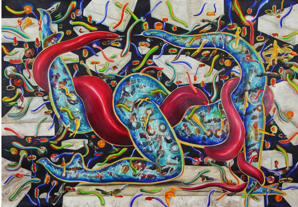
Eric Erotica 150 x 200 oil on canvas at Kamil Art Gallery