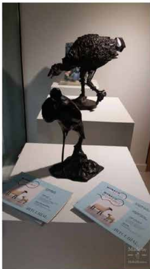
A selection of pieces of art from "Monaco Sculptures" (Artcurial Monaco, 24th April 2019).

The Principality, in fact, hosts a variety of top-level figures working all year long in the field of Art. MAW acts as a 'trait d'union' putting them on one stage despite being scattered in different districts. Besides MAW, art-montecarlo, iconic fair of modern and contemporary art, hosted at the Grimaldi Forum from the 26th until the 28th April 2019, makes Art unveil its true "social" identity regardless of any business-oriented approach.