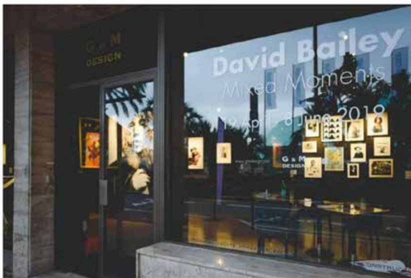
The exhibition "David Bailey, Mixed Moments" (G&M Design, 24th April 2019).