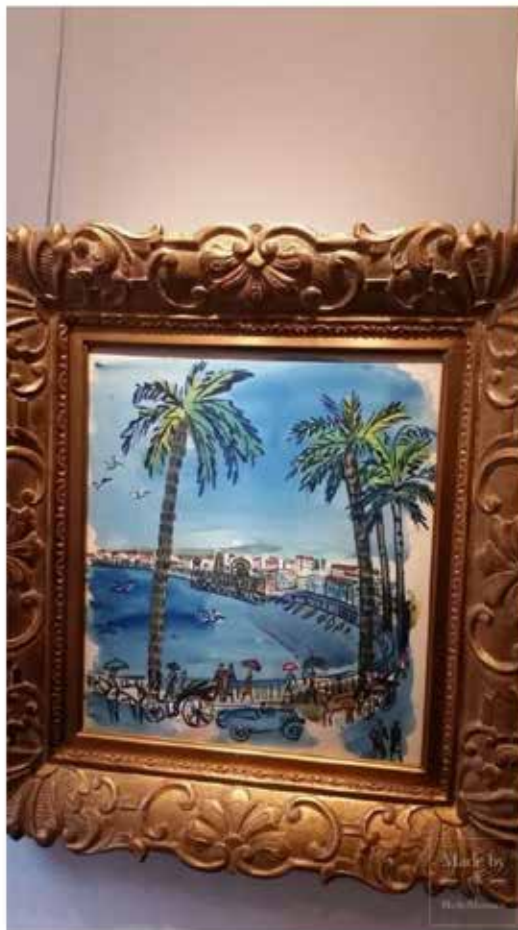
Masterpiece by Raoul Dufy, 1928 (Les Galeries Bartoux, 24th April 2019).