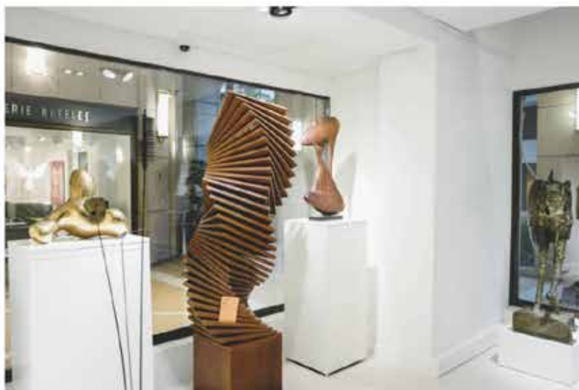
Part of the exhibition "Monaco Sculptures" (Artcurial Monaco, 24th April 2019).