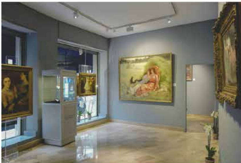
Series of Belle Époque paintings from French, Italian and Spanish artists (Wannenès – Art Contact, 24th April 2019).

An exquisite series of Belle Époque paintings from French, Italian and Spanish artists, part of a private collection on auction, is displayed at Wannenès – Art Contact (Monte-Carlo) arousing impressionist-like feelings of delicate human figures and marine landscape dating back to glorious times between the two World Wars. 'Monaco Sculptures' by Artcurial (Monte-Carlo), at its first edition from 24th April until 31st July 2019, allows visitors to enjoy a surprising overview on relevant artists' creations from the 20th and 21st centuries, located in the most symbolic places in Monaco, before being auctioned. Masterpieces of different dimensions, by Aristide Maillol, Bernard Venet, Wang Du, Richard Deacon, Kaws, just to name a few, are being part of the Monegasque urban environment in cooperation with the Société des Bains de Mer.