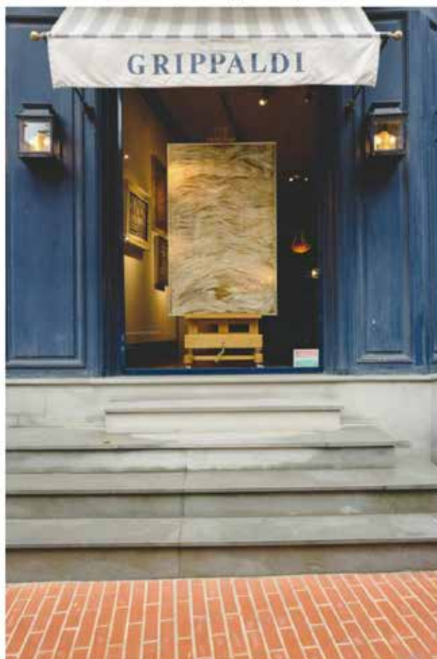
The exhibition "Arman, les années 60" (Galerie Grippaldi, 24th April 2019). © Valentina De Gaspari