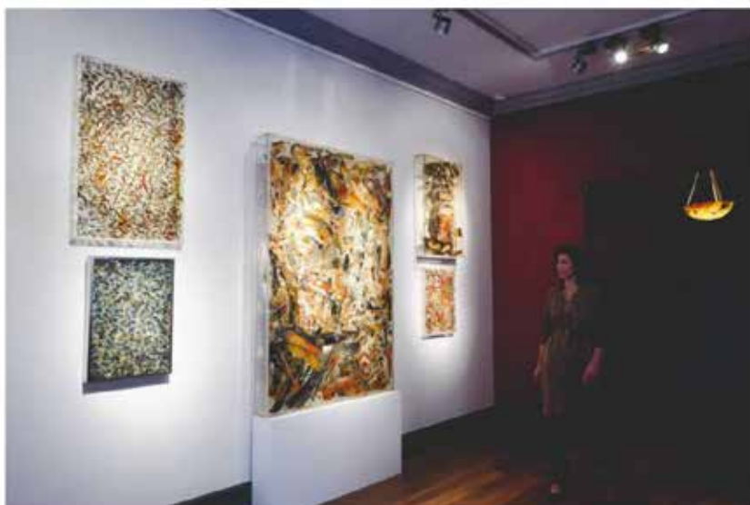
The exhibition "Arman, les années 60" (Galerie Grippaldi, 24th April 2019).