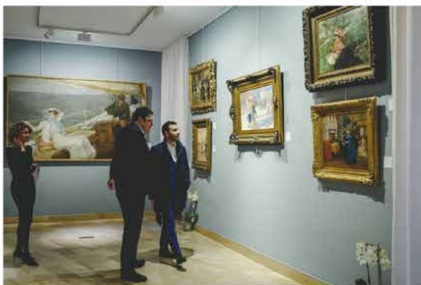
Series of Belle Epoque paintings from French, Italian and Spanish artists (Wanneries - Art Contact, 24th April 2019).

"The purpose of Art is washing the dust of daily life off our soul", used to say Pablo Picasso. The current edition of Monaco Art Week (MAW), held from the 24th until the 28th April 2019, is definitely directing everyone towards the best in Art. This special event, in its second edition, results from a combined cooperation among the best Art Galleries and Auction Houses based in the Principality with the aim to promote internationally the Monegasque territory as a reference point to the art scene.