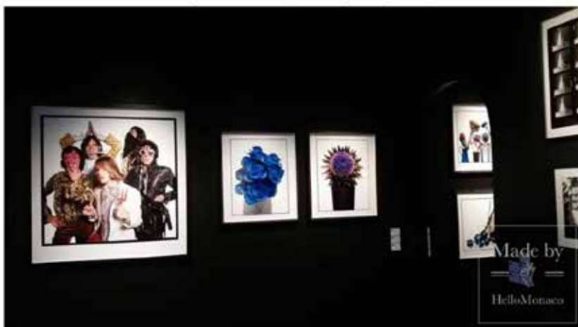
The exhibition "David Bailey, Mixed Moments" (G&M Design, 24th April 2019).