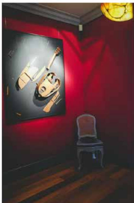
The exhibition "Arman, les années 60" (Galerie Grippaldi, 24th April 2019).