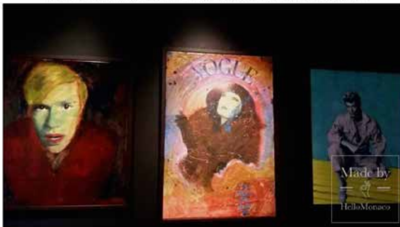
The exhibition "David Bailey, Mixed Moments" (G&M Design, 24th April 2019).