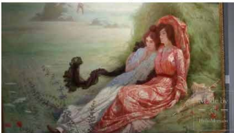
"En campagne" by Ludovic Alleaume – detail (Wannenès – Art Contact, 24th April 2019).