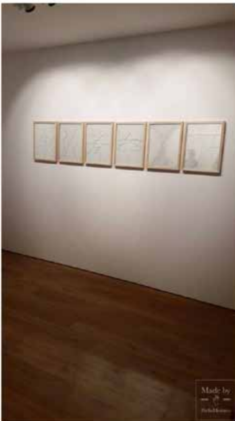
Pieces of art by Andrea Francolino within the project "Caso x Caos x infinite variabili" (NIM-Contemporary, 24th April 2019).