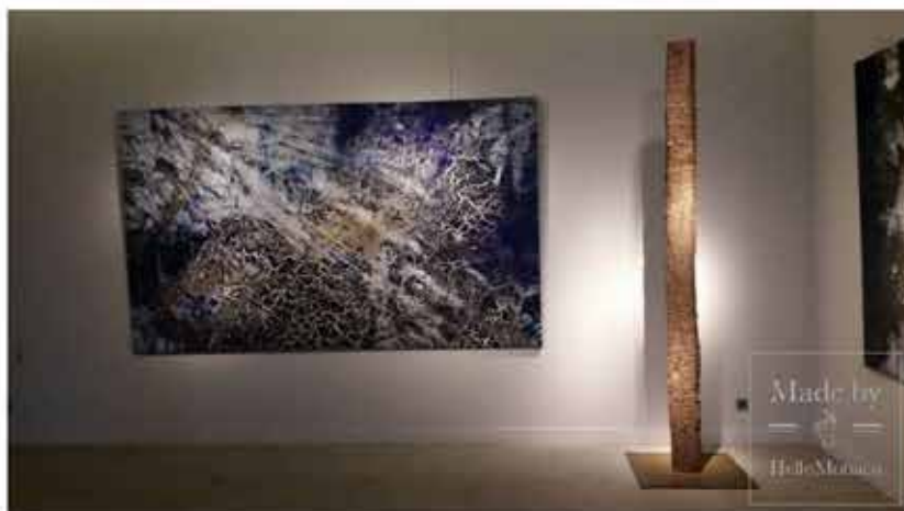
The exhibition "Terre & Métamorphoses" by Philippe Pastor (Monaco Modern'Art, 24th April 2019).

"Terre & Métamorphoses" (Lands and Methamorphosis) at Monaco Modern'Art (Larvotto) displays a series of paintings, sculptures and a new installation "Arbres Brûlés" (Burnt Trees) by Philippe Pastor. The artist focuses on the troublesome relation between Man and Nature by using natural pigments, bronze and iron. Shape-less matter takes on powerful forms expressing the energetic forces of Nature that seem to fight against climate change and further disrespectful human actions. A very topical message.